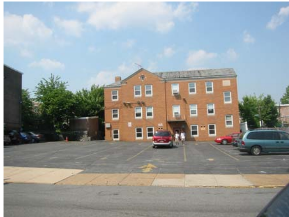
“Mother Angela Building” + Parking