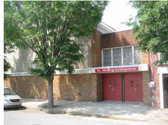
Gymnasium, Stage, and Banquet/ Assembly Hall