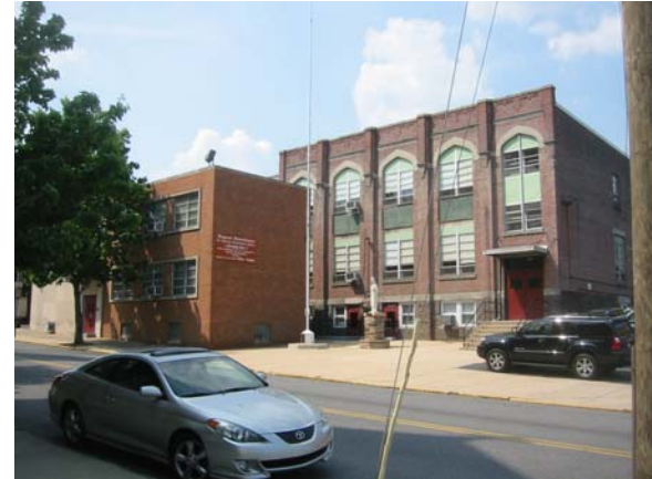
The “Old School” (Annex to Left)