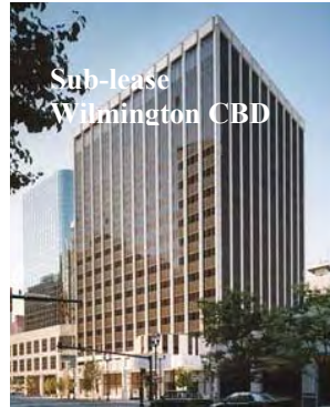
Sub-lease Wilmington CBD