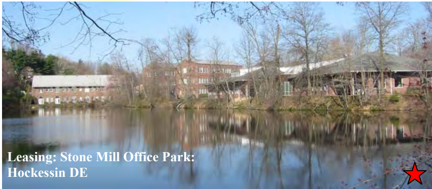
Leasing: Stone Mill Office Park: Hockessin DE