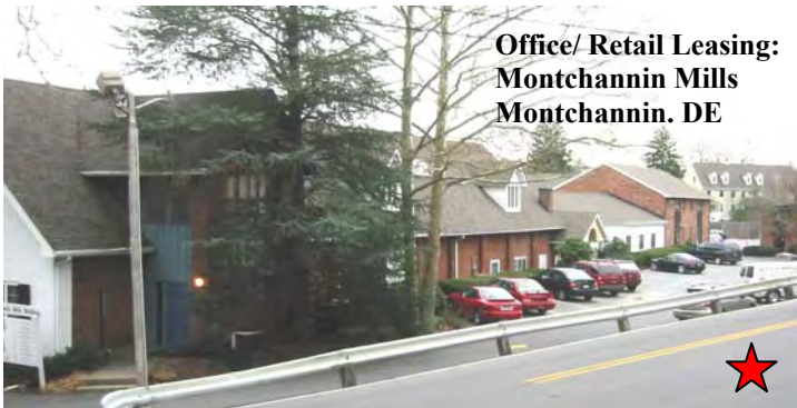
Office/ Retail Leasing: Montchannin Mills Montchannin. DE