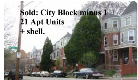
Sold: City Block minus 1 21 Apt Units + shell.