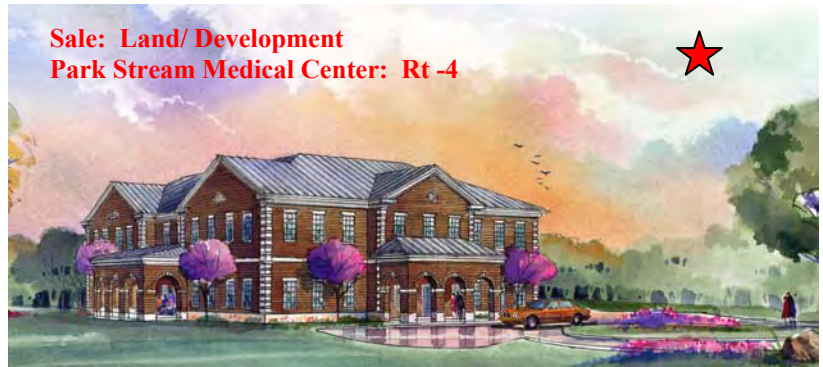
Sale: Land/ Development Park Stream Medical Center: Rt -4