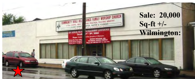
Sale: 20,000 Sq-ft +/- Wilmington: