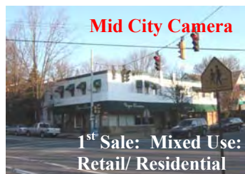
Mid City Camera