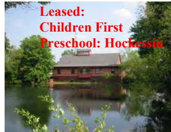
Leased: Children First Preschool: Hockessin