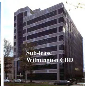
Sub-lease Wilmington CBD