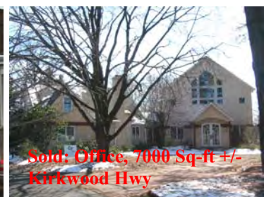
Sold: Office, 7000 Sq-ft +/- Kirkwood Hwy