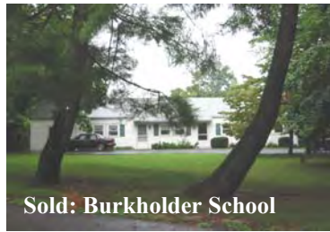
Sold: Burkholder School