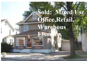
Sold: Mixed Use Office, Retail, Warehouse Elsm. Pk