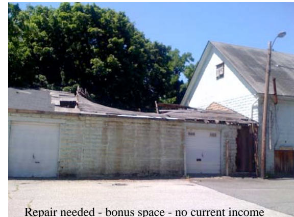
Repair needed - bonus space - no current income