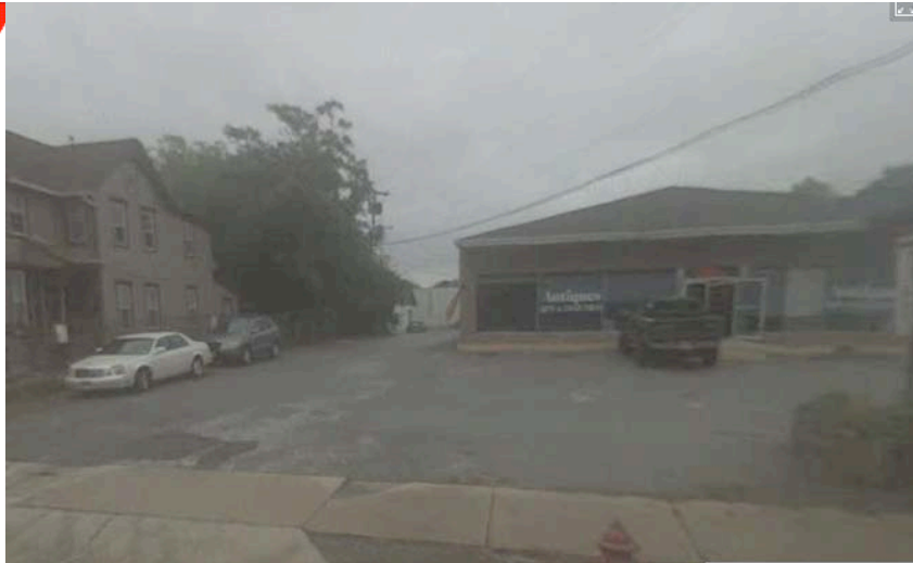
Antique Store Front - 8,000+ sq ft Rented 30 dealers @ $125/mo + 15% of sales 2nd floor 1,000 sf vacant; Basement 3,000 sf vacant was formerly used for storage/mach shop has sep entrance.