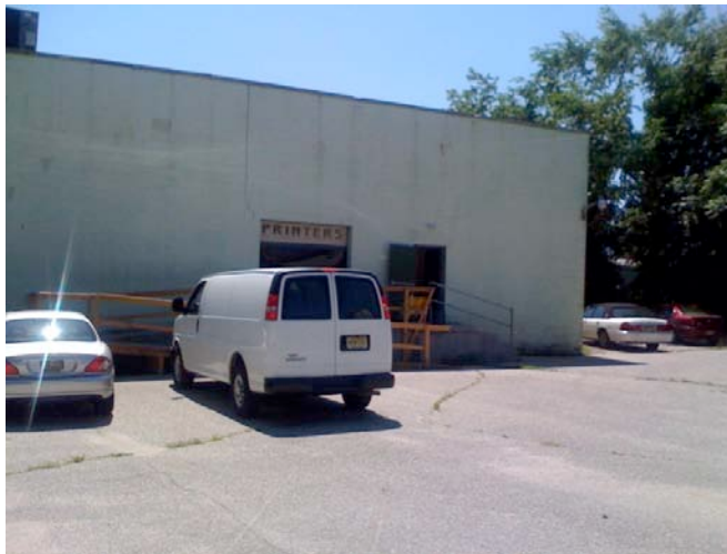
Printer - 5000 sf bldg, 20' ceilings Rented $1,580/mo